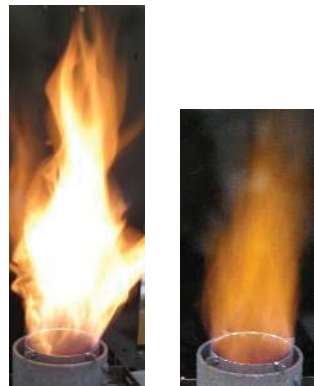
Fuel 100% Water 50vol% Fig.2 Burner flame