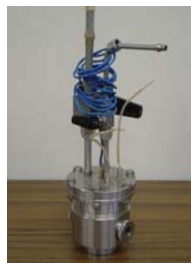
Fig. 3 special IR cell.