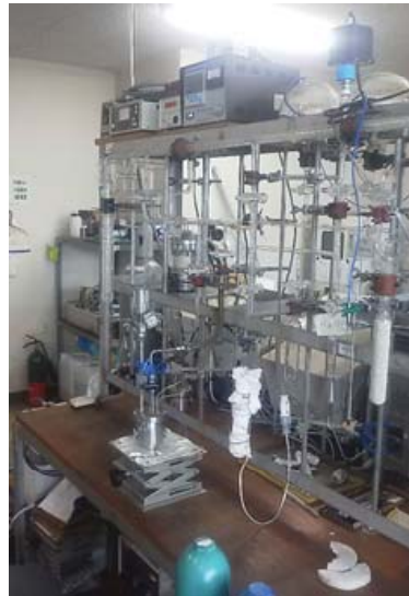
Fig. 1 Volumetric apparatus for measurement of adsorption & desorption velocity of water on adsorbents..