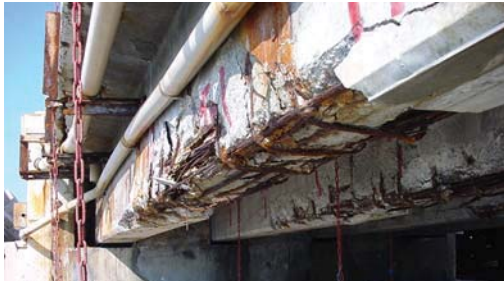
Fig.1 A concrete structure damaged by chloride attack